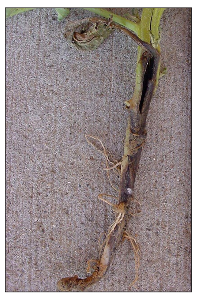
\begin{tabular}{ll} \textbf{Figure 1. A} & \textbf{POTATO PLANT WITH A BLACK, DECAYING STEM TYPICAL} \\ \textbf{OF BLACKLEG.} \end{tabular}

Blackleg is caused by Erwinia atroseptica (synonym: Pectobacterium carotovorum subsp. atrosepticum ) and soft rot is caused by E. carotovora (synonym: Pectobacterium carotovorum subsp. carotovorum ). These bacteria can live in soil, in decaying plant debris, and in seed tubers. Bacteria either enter seed potatoes and lower stems through wounds and injuries, or move directly from contaminated seed pieces to lower stems. Abundant moisture at the surface of the wounded tissue is needed for infection, and continued high humidity after infection favors